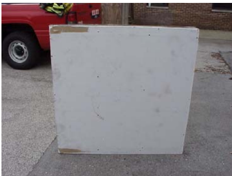
4' x 4' wall with metal stud framing and Hi-Impact 8000 wallboard mounted to both sides of the wall.

The test was conducted by igniting approximately 4 pieces of packing paper inside a 4' x 4' simulated wall. The paper simulated any burning materials that could fall inside the wall during a structure fire. The wall was constructed using 2 – 4' x 4' sections of Hi-Impact 8000 wallboard mounted to metal stud framing on 16" centers. The pictures of the wall are below: