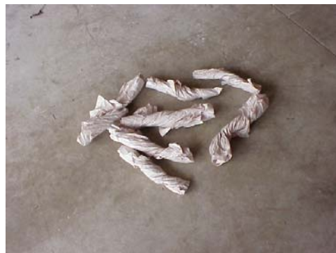
Approximately 4 pieces of white packing paper were ignited inside the wall to simulate burning materials that have dropped into the wall during a structure fire.